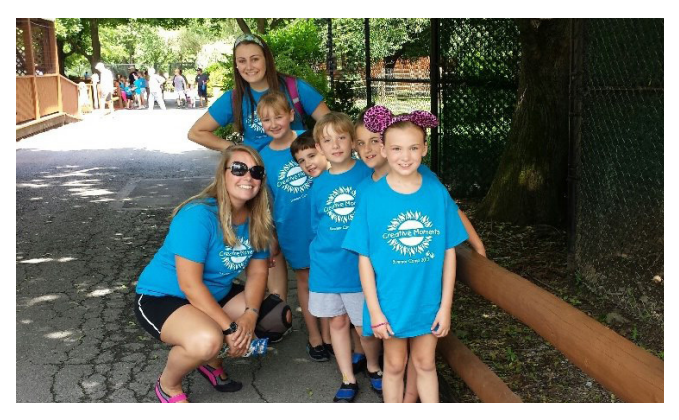
2013 Summer Camp