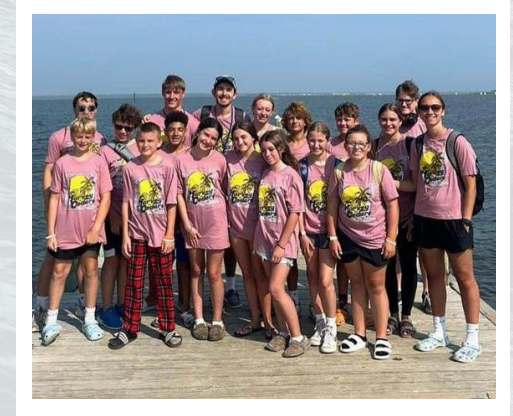
Harvey Cedars Bible Camp - MS